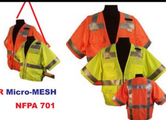
FR Micro-MESH NFPA 701