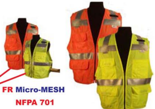
FR Micro-MESH NFPA 701

NFPA 701 Polyesters & Micro Mesh for General FR Applications. Not rated for Arc. See the complete FR Technical Brief.