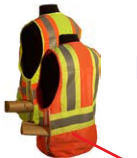
Back Survey Pocket w/Zipper!