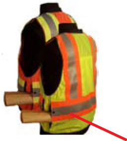
Back Survey Pockets w/Snaps