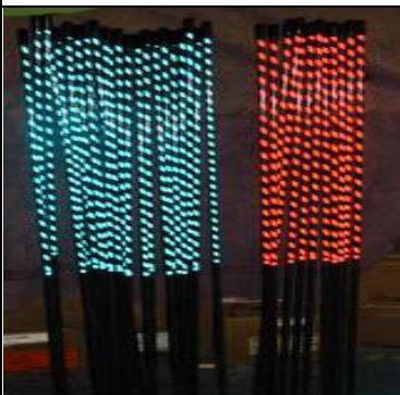
Swirls of reflective color make our swirl bands GLOW!