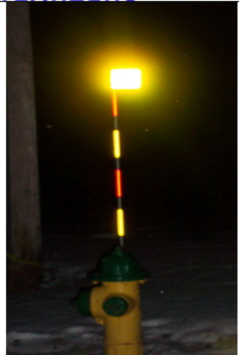
"Phoenix banding" with crystal flag shown

These are the most adaptable markers we make, perfect for any area! Every marker we make is 100% Custom Made 100% of the time In the U.S.A! Hy-Viz markers get your hydrants noticed, in rain, fog, snow, behind parking violators , debris, in fields, or dark roads ~ Our markers do the job year round!