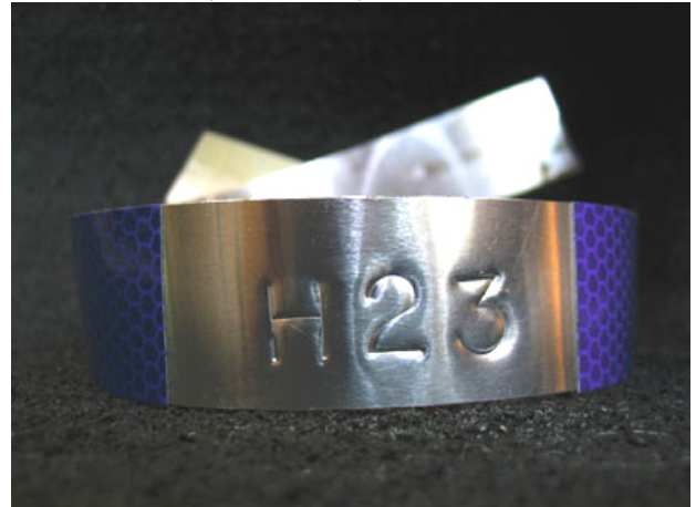
Deep hand-stamped identification

These are PERFECT to wrap around anything you need numbered, identified, labeled or tracked!