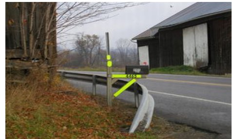
The ULTIMATE Mailbox/Post Reflector!