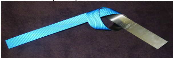
Flexible reflective sign panels for ANY situation or use! “Perfect to wrap around ANYTHING!” Flexible panels are incredibly adaptable, easy to cut, wrap, twist or fold!