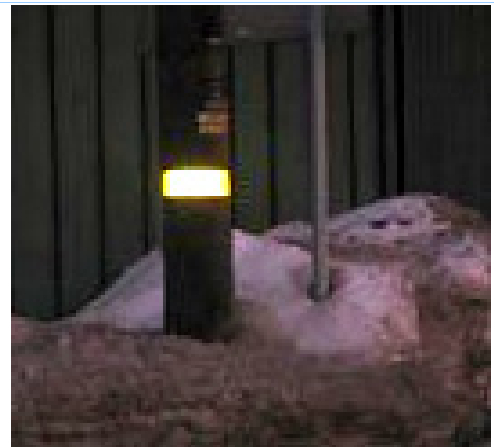
Great for Utility Poles!