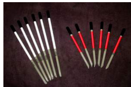
Reflective spikes – in any color!

Try our 12” or 8” Safety Spikes. These are great for edges of gardens, driveways, locators and more!