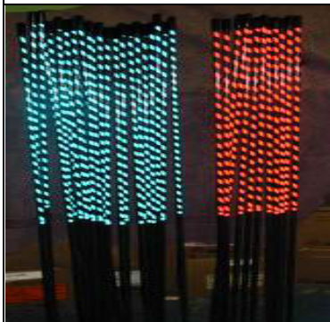
Swirls of reflective color make our swirl bands GLOW!

Tri-banded Markers & Swirl Bands Reflective markers with three reflective bands for any holiday, nationality, sports team or more