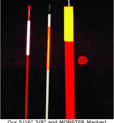
Our 5/16" 3/8" and MONSTER Marker!

And Finally – Attention Landscapers and plow operators-Be Prepared! If you are looking for economical markers in high quantity (for snowplowing, etc.), we always these in stock for delivery - call us!