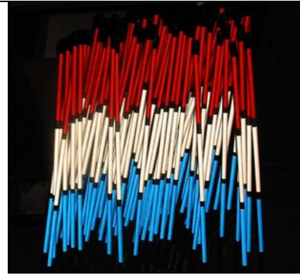
Patriot tri-band markers

ALL our markers use the same fiberglass and reflective banding we use on our hydrant markers- ~ No shortcuts here! Only the best! ~ Ask about our lifetime breakage warranty!