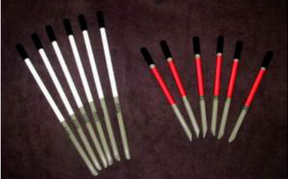
Reflective spikes - in any color!